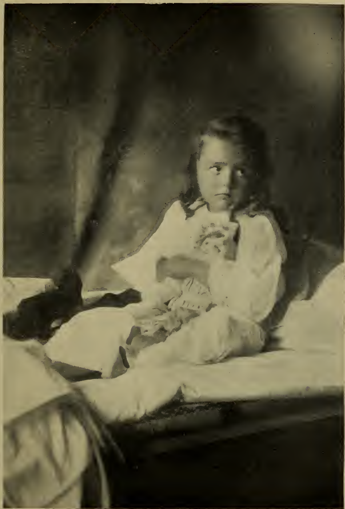
"I WOKE UP ONCE IN THE NIGHT, AND I WAS AFRAID"